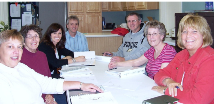
Night at the Louvre Committee

In 2010, our fundraisers made a total of $81,212.00!